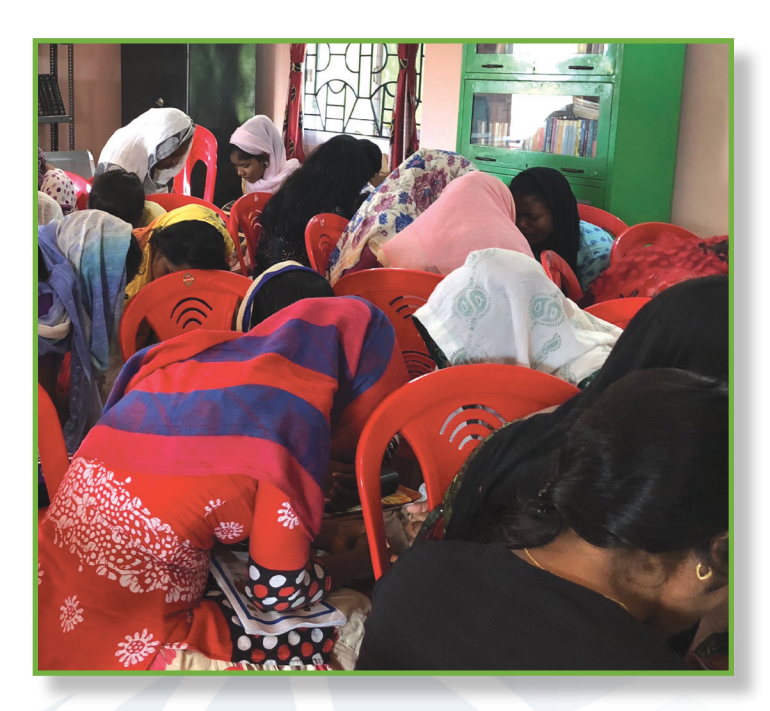
Praying in India

There have been other firsts this year. ASK teams traveled twice to India to teach the simple but profound principles of praying the Word of God for any situation, small or large. There is new encouragement in South East Asia where we have seen the first signs of growth in Thailand. Another significant first was a visit to Cuba where the soil is well prepared through many years of waiting and, we discovered, a leader prepared. We see this as a gateway to Central and South America.